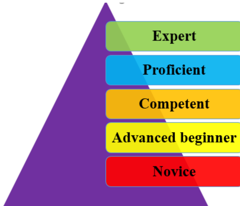
Figure 1: Five-step model of professional excellence.